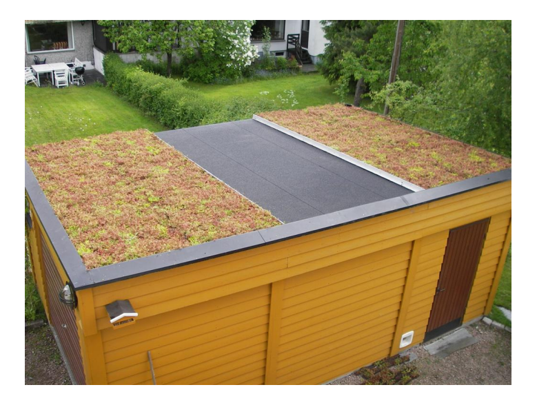
Figure 1. The left hand side sedum roof and the reference was compared

A 25 year old garage roof in Oslo was divided into 3 equal parts, each 8 m<sup>2</sup> (see photo). An extensive sedum roof, with soil depth 3 cm, was installed on part 1 and 3, while part 2 was the reference. The green roof was a product from <u>www.vegtech.se</u>. Only roof no. 1 (Veg Tech System XMS 0-4) and the reference (no vegetation) are compared in this paper. The roof slope was 3.2 degrees.