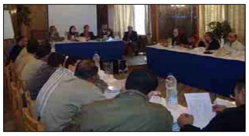
Environmental Impact Assessment (EIA) (for assessors) 10<sup>th</sup> - 14<sup>th</sup> December 2006

Sustainable Development 17<sup>th</sup> – 22<sup>nd</sup> February 2007