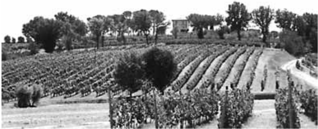
Figure 5 - The sandy-clayish hills around Bevagna are covered with the vineyards of the Sagrantino vine

the Umbria region emerged and the subsequent sedimentations occurred in the lakes that characterize the Late Pliocene and Pleistocene (Villafranchian). The Great Tiber Lake was the largest one, going