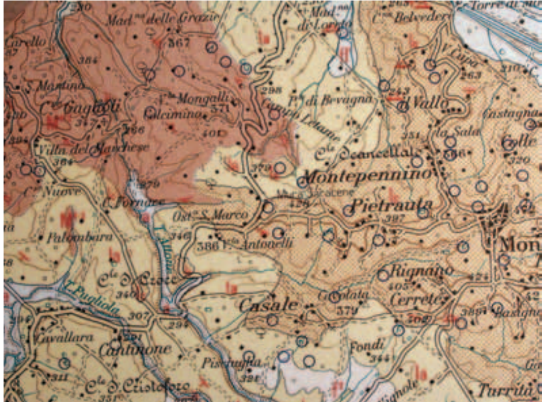
Color Figure 3 - Montepennino surroundings geologic map. The Antonelli vineyards are spread on three different substrates, the Marnoso-arenacea Fm. (a pre-orogenic flysch), clay /sand, and conglomerates of lacustrine environment. M 4-2 =Marnoso-arenacea Fm., Middle Miocene. la=Lacustrine clay and sandy clay, Late Pliocene/Pleistocene. lc=Lacustrine conglomerates and sands, Pleistocene. f=Fluvial deposits, recent