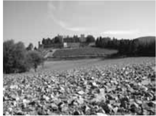
Figure 3 - Brolio Castle and the vineyards which produce the “Chianti Castello di Brolio”.

In the Ricasoli winery it will be possible to taste some types of wine grown in different soils and different climatic environments. After the winetasting we shall go to “taste” the geology in the field, visiting some vineyards planted on different lithologies. The agronomist and enologist of the Ricasoli winery will explain to us the characteristics of the soils and their