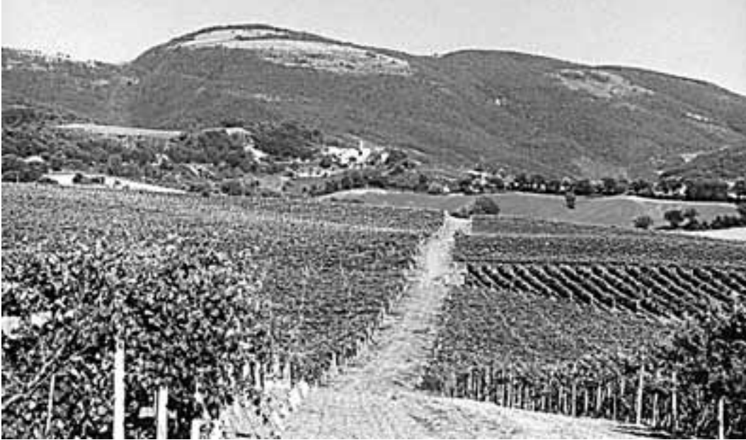
Figure 9 - The Verdicchio vineyards in the Matelica syncline. On the left may be seen the western side of the anticline that shelters the area from marine winds.

migrating aquatic birds. The name Colfiorito derives from the flowers that in spring completely cover the flats in a colored tapestry.