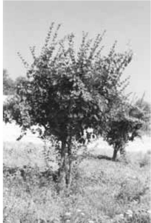
Figure 8 - Close to Serrapetrona an ancient way of growing grapes may be seen, The vines are "maritate" (married) to living trees, and long lines strung from tree to tree hold the vine branches.

Leaving Bevagna, we go through Foligno and take