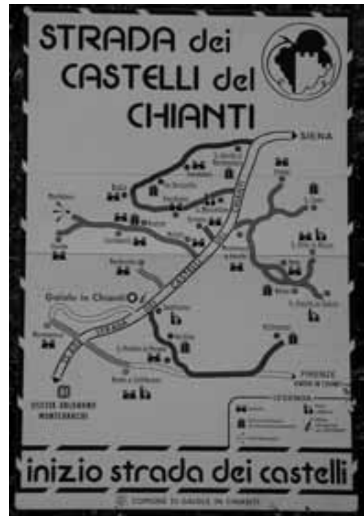
Fig 1 - A poster advertising that we are entering the "Castelli del Chianti" realm.

Later we drive along the Valdarno, a large valley that in the Late Pliocene – Early Pleistocene was occupied by a wide lake. Within the lacustrine sediments, containing thick banks of lignite, several fossil bones of mammals were found and recovered; now, restored, they are in the museum of the Geological Institute of Florence: elephants, hippopotamus, rhinoceros,