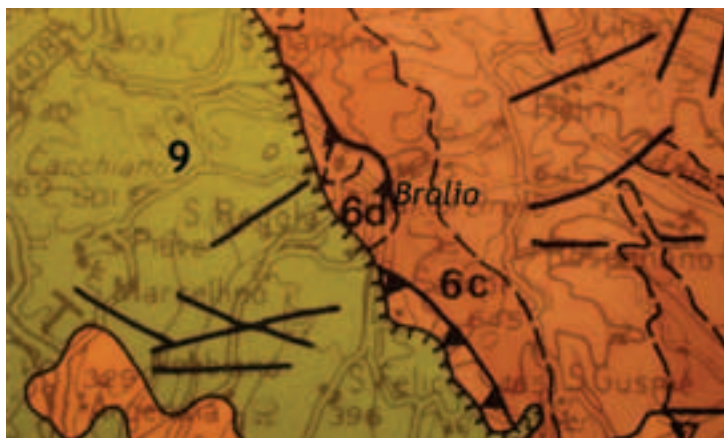
Color Figure 1 - Brolio geologic map. Brolio Castle and related vineyards lying along the contact between Scisti Policromi, Macigno (Tuscan units) and Alberese, Galestri and Palombini limestone (Ligurid units). 6c=Scisti policromi/Nummulitico, Eocene–Lower Oligocene. 6d=Macigno, Upper Oligocene. 9=Galestri and Calcare Alberese, Upper Cretaceous–Lower Eocene.

The Crete Senesi region take its name from Pliocene clays ( creta means clay) laid down by the transgressive post-orogenic sea that covered the Siena-Radicofani Basin. The lithology consists of clay and sandy clays; owing to the thickness of the lithofacies, to their wide outcrops and to the peculiar climatic conditions, the morphology is characterized by badlands and by a moon-like landscape. From Buonconvento we reach Montalcino built on a hill that is the northern part of the M. Amiata ridge which bounds to the west the Siena-Radicofani Basin.