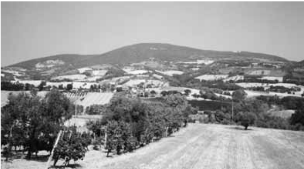
Figure 11 - View of Monte Conero from the southwest: the highest part is covered with “Mediterranean macchia”, while the lower part, sheltered from the cold northeastern winds has vineyards and other crops

On these lands the Verdicchio develops best and it is very sensitive to the soil characteristics and to the exposure, giving different results even in vineyards very close to each other. The vineyards are generally small and the pieces of land are highly fractionated,