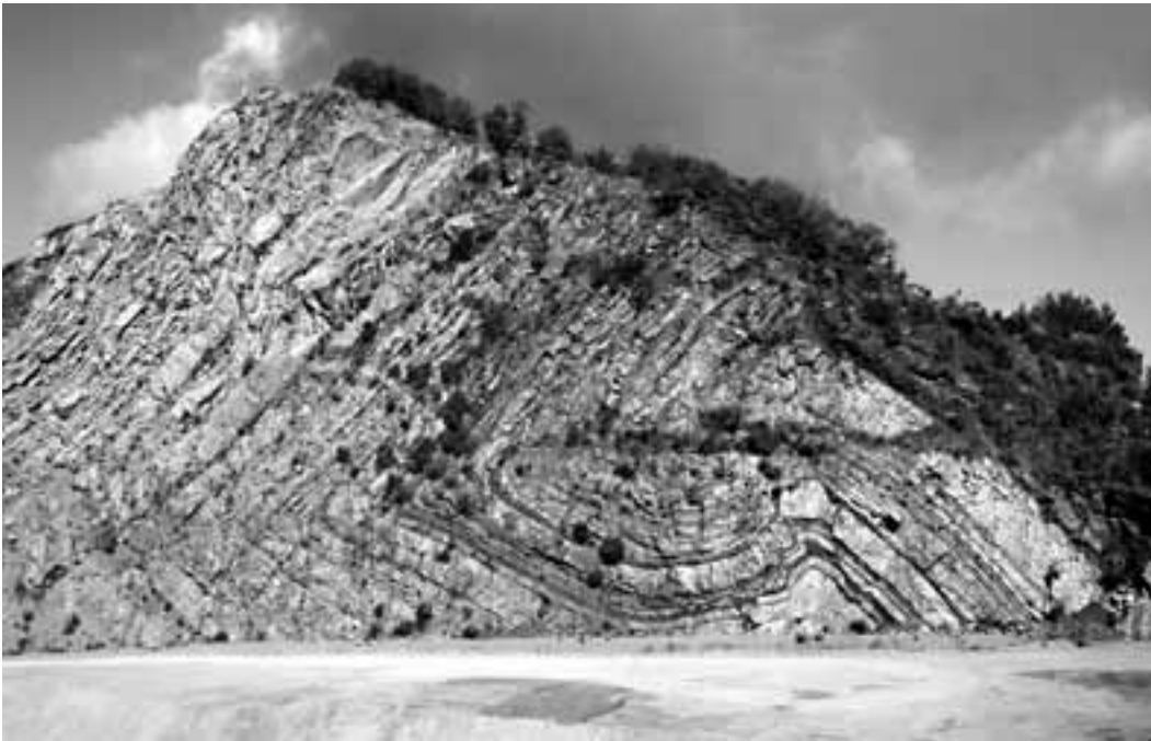
Figure 2 - Montegrossi quarry: the Montegrossi calcarenites form a double fold; on the left side, west-dipping calcarenite beds are reversed, in the middle, due to a synform they become normal, and on the right an anticline changes the dip to the east. The Dudda argillaceous rocks are ejected from the syncline core

Brolio Member”; the middle part is made up of thin and thick (up to 2 m) beds of turbiditic calcarenites with Nummulites, and it is named the “Calcareniti di Montegrossi Member”; the uppermost part consists of reddish shales with minor intercalations of thin calcarenite beds (“Argilliti e Calcareniti di Dudda Member”). This member passes upwards to the tur-