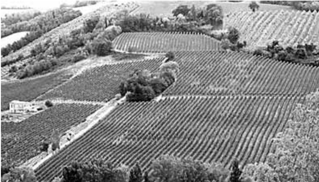
Figure 10 - Verdicchio vineyard around Jesi, well organized on a downhill slope, on the Pliocene sandy clay of coastal plain.

Going on towards the northeast we cross the front range of the Marche Apennine, which is an anticline thrust to the east. On the eastern limb