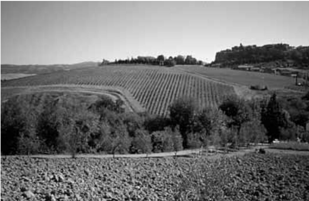
Figure 7 - Vineyards of the Orvieto wine lying at the base of the cliff. On the right is visible the abrupt wall that delimits the tufa bank. On the flat top of the hill is visible the Orvieto skyline with the pinnacle of its famous Dome.

Following the Tiber valley we enter the “Gola del Forello” excavated through the northern ramification of the Monti Amerini. Then, driving beside Lake Corbara, we may see the typical outline of the Orvieto zone: Plio-Pleistocene sandy clays, above which we find a high cliff made up by thick banks of volcanic tuffs and lavas, with steep sides and a flat top. On the flat top rests the beautiful city of Orvieto.