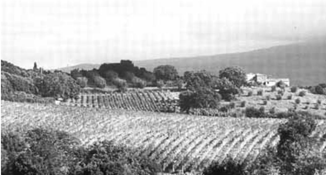
Figure 4 - Vineyards of the “Brunello di Montalcino” spread on the hills around the town.