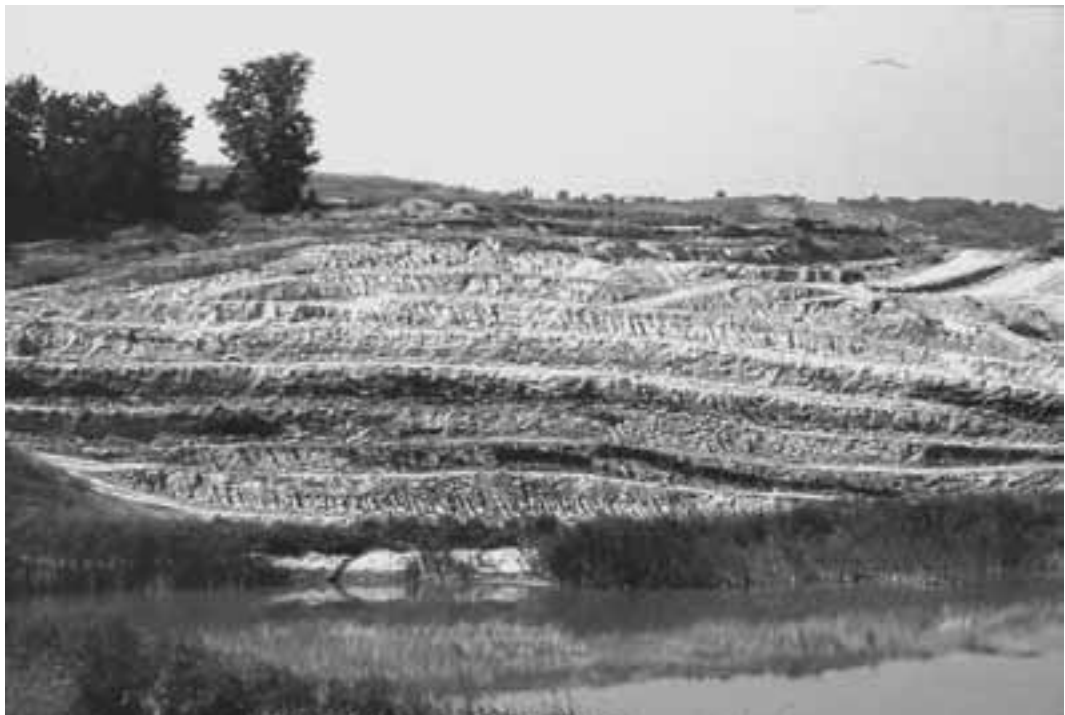
Figure 6 - At Briziarelli quarry, the oldest part of the lacustrine deposit crops out: the bluish clay contains banks of lignite broken by Pleistocene tectonics. In the upper part the deposit becomes more and more sandy.

from Città di Castello to Terni for around 100 km. It had a reverse Y shape and close to Perugia divided into two arms, the eastern one called Umbra valley and the western one called Amerina valley. The