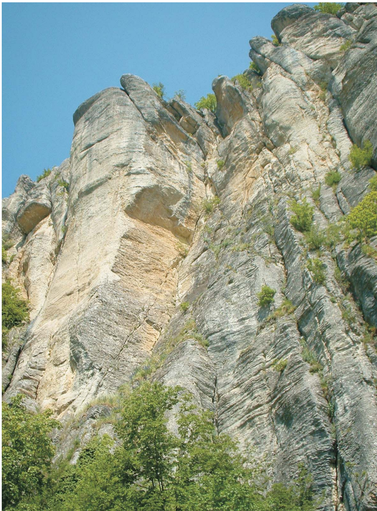
Fig. 4 – One of the walls of the climbing sector Vecchie Gare . – Una delle pareti del settore di arrampicata Vecchie Gare.