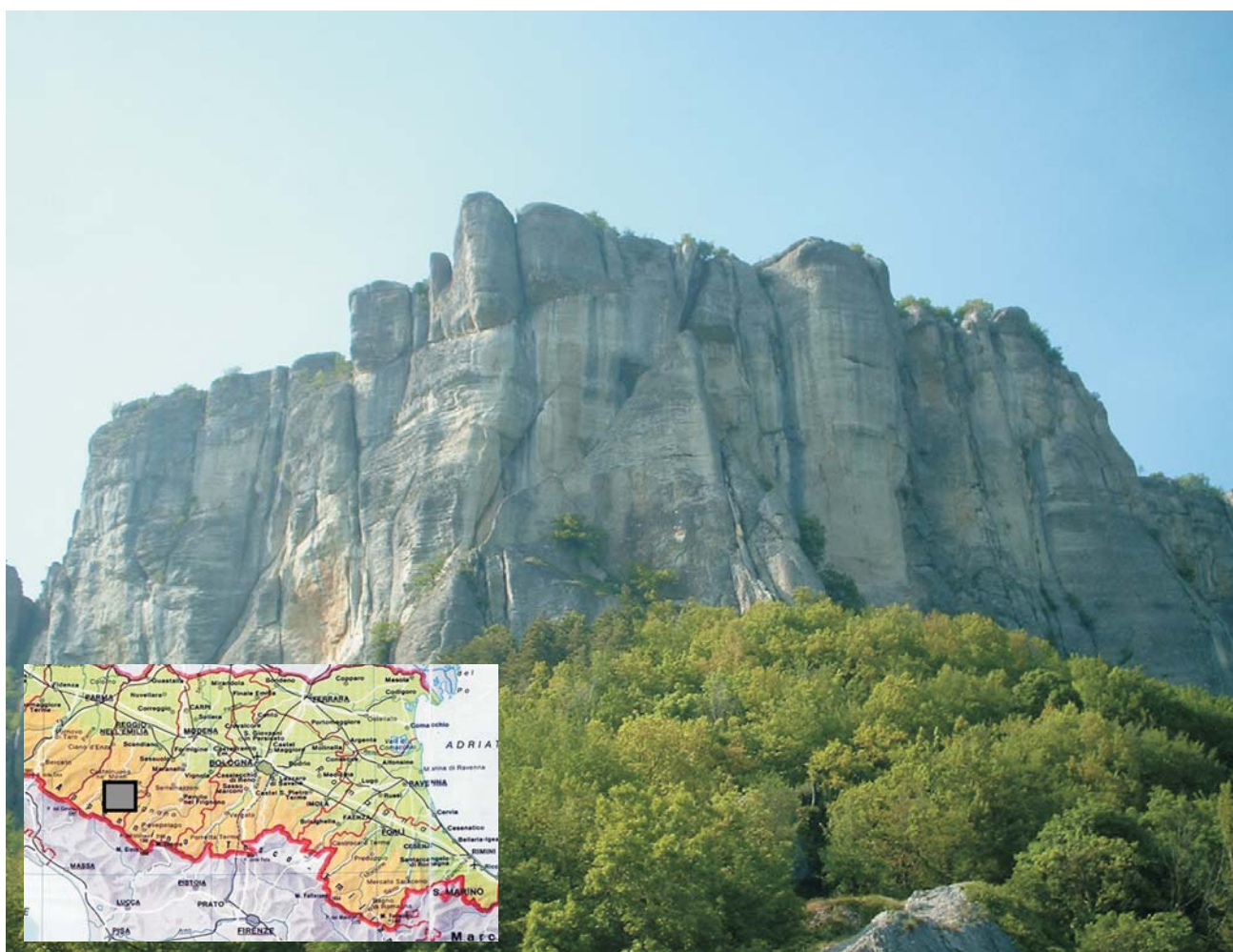
Fig. 1 – Location and general view of Pietra di Bismantova. – Ubicazione e veduta generale della Pietra di Bismantova.