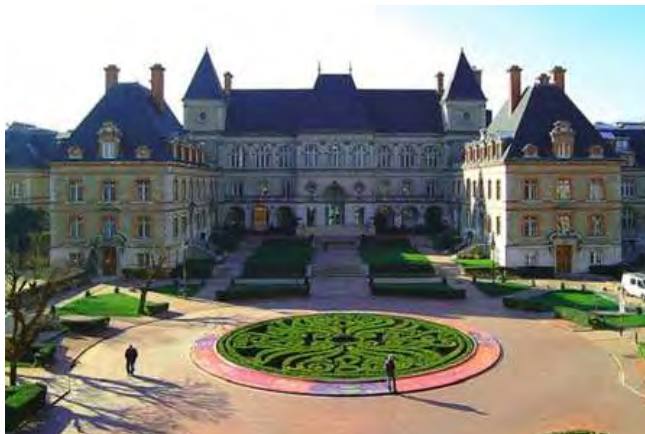
The conference will take place at the Maison Internationale, Cité Internationale Universitaire, Paris 14 e , France

These discussions will enable a deeper understanding of the E&H concerns and how research may contribute to resolving them.