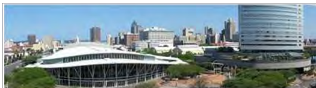
The Climate Change Conference was held in Durban, South Africa

http://www.who.int/globalchange/mediacentre/events/2011/durban_climate_change_conference/en/index.html