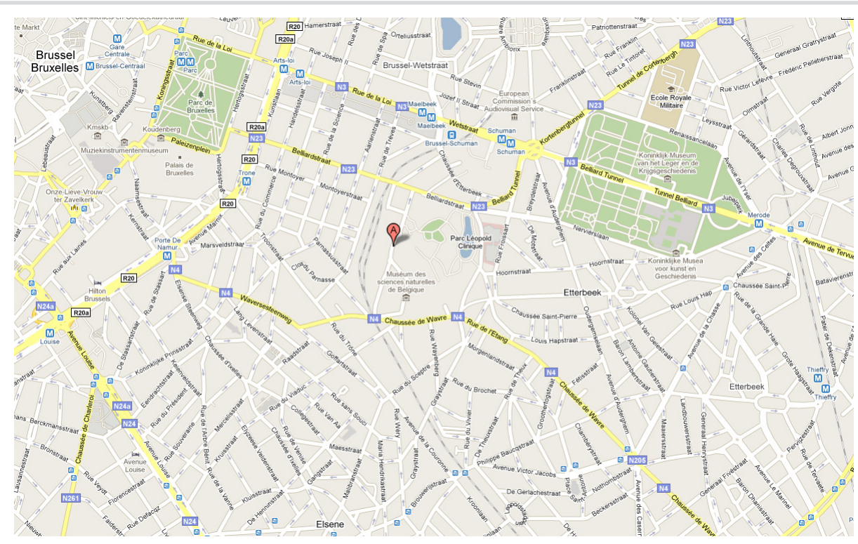
CLICK ON THE MAP FOR FURTHER INFORMATION

European Parliament Paul-Henri Spaak building Rue Wiertz 43 Brussels, Belgium