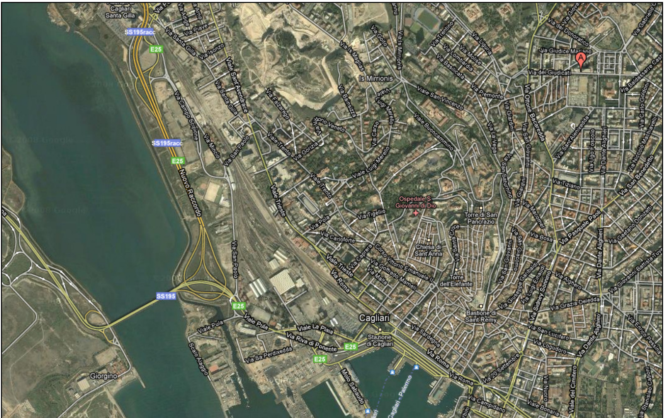
T Hotel location and the Cagliari Port.

centro”, following indications towards “Cagliari Centro” and Via Valenzani. At the first crossroads after the Conad Supermarket turn right and drive down Via Ciusa and Via Bacaredda. Go straight over at the traffic lights and after the second Agip petrol station turn left into Via Cao di San Marco. Take the first turning to your left on reaching the square. The hotel is situated in Via Dei Giudicati, facing the Theatre, adjacent to Piazza Giovanni XXIII.