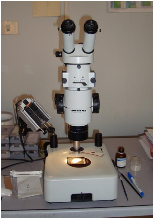
Microscopio ottico Wild M10