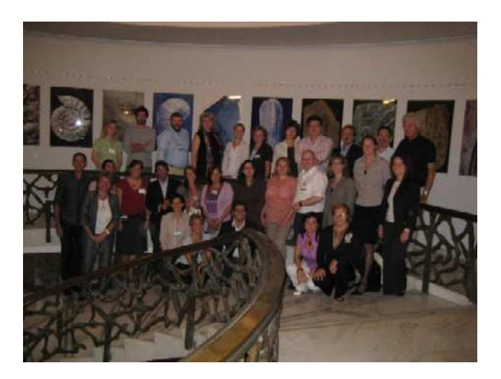
For further information, visit our web site: <u>http://www.era-envhealth.eu</u>