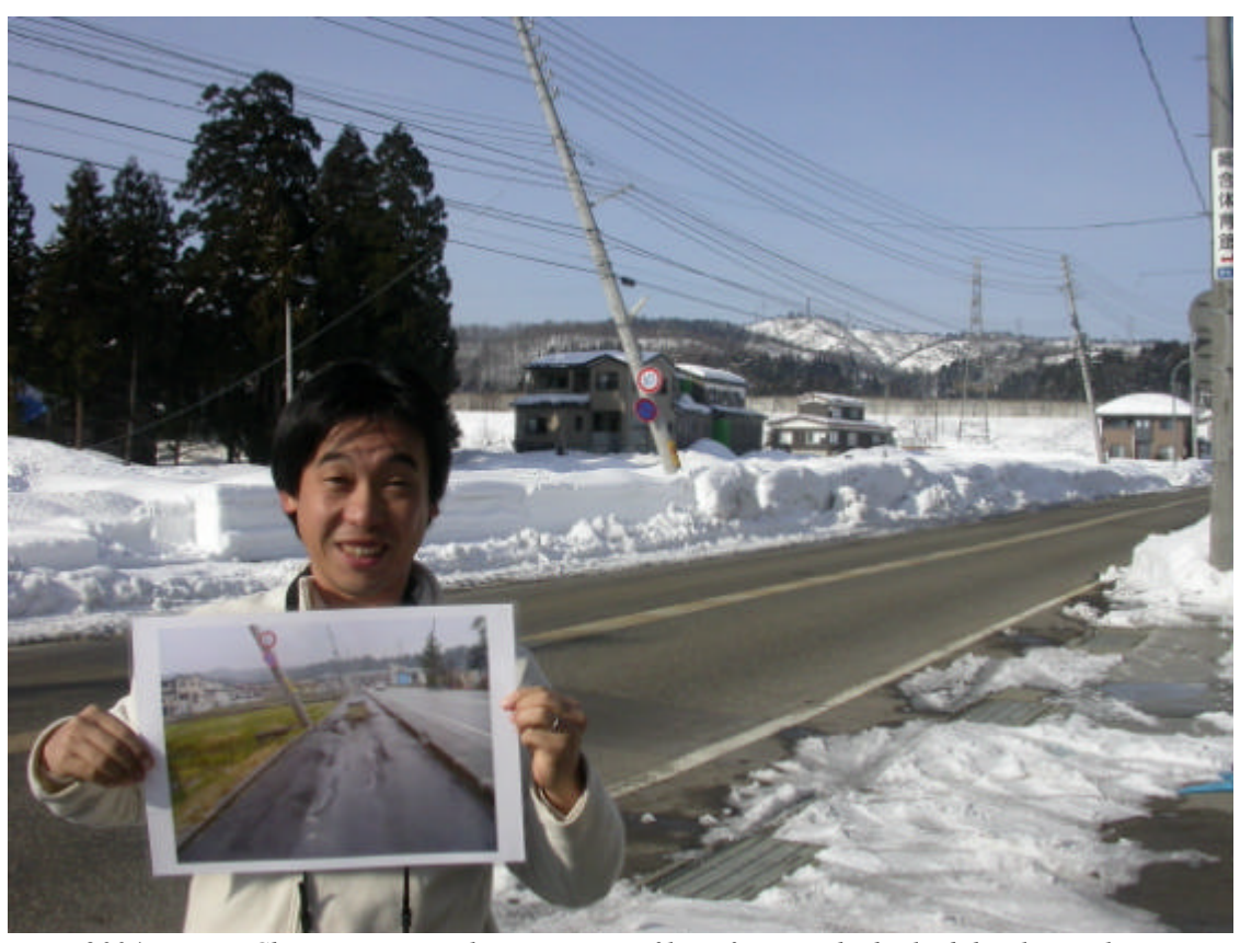
2004 Nijgata-Chuetzu epicentral area: a case of liquefaction which tilted the electric lines, covered by snow but evident in the picture.