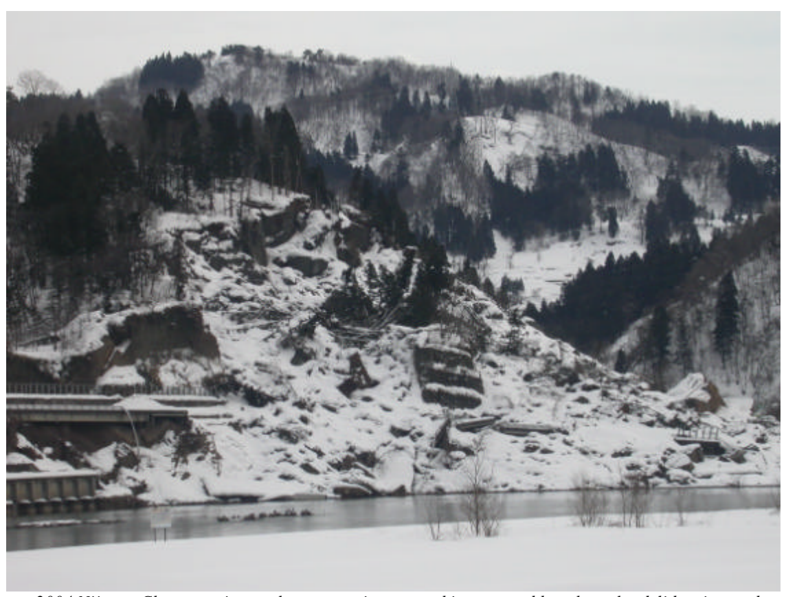
2004 Nijgata-Chuetzu epicentral area: a primary road interrupted by a huge landslide triggered by the earthquake