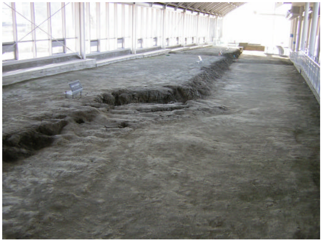
Hokudan: the trace of the 1995 fault rupture, as preserved in the Nojma fault museum.