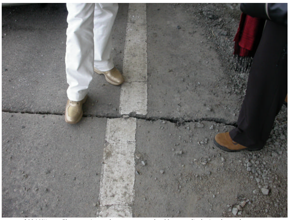
2004 Nijgata-Chuetzu epicentral area: an example of fracture displacing the road pavement