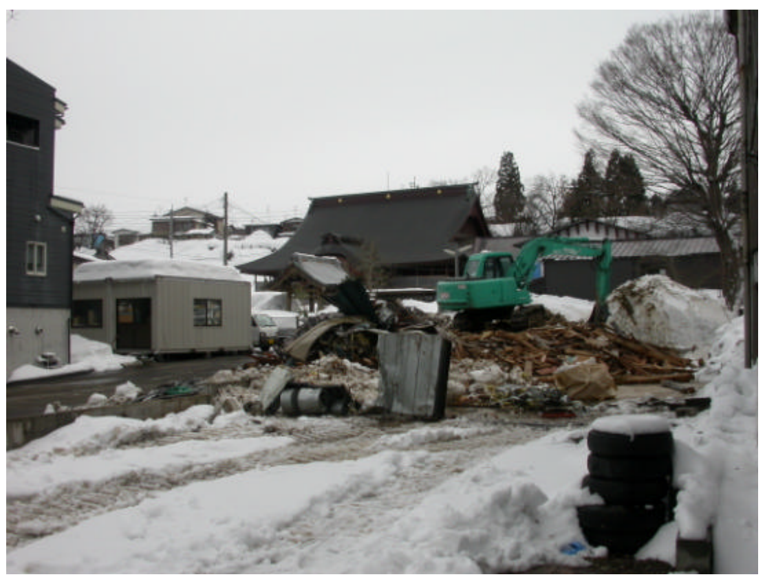
2004\ Nijgata-Chuetzu\ epicentral\ area:\ a\ small\ house\ destroyed\ after\ the\ earth quake