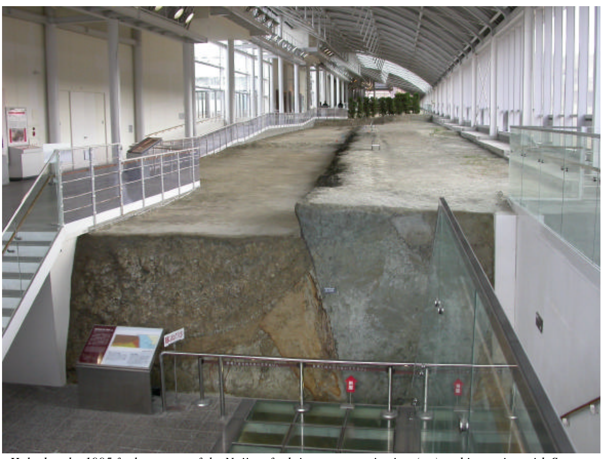
Hokudan the 1995 fault rupture of the Nojima fault in a panoramic view (up) and in section with S. Porfido (below).