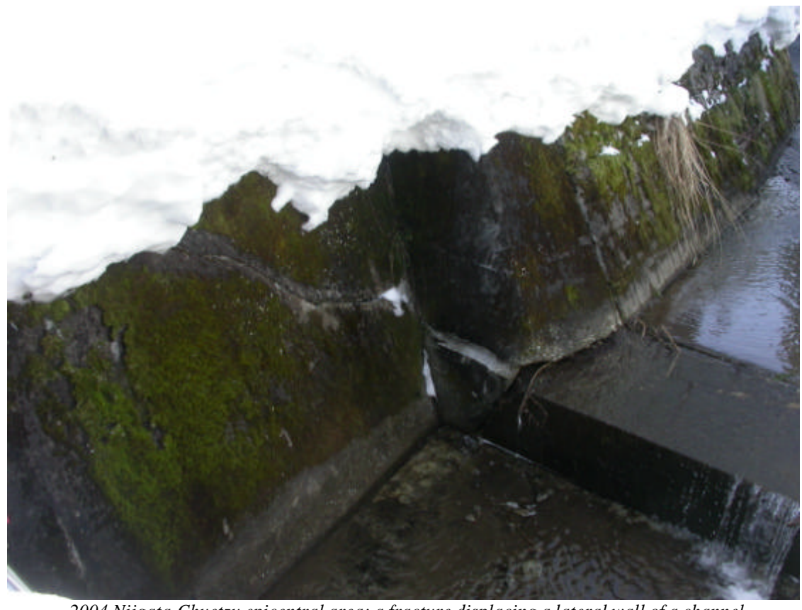
2004 Nijgata-Chuetzu epicentral area: a fracture displacing a lateral wall of a channel