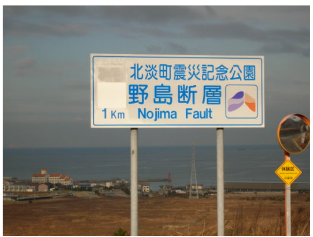
Hokudan: signals on the road indicate the location of the Nojima fault, which reactivated during the 1995 Kobe earthquake