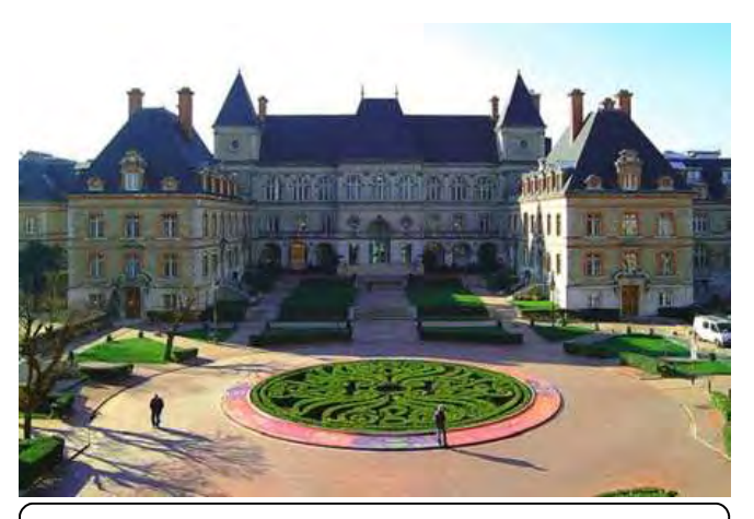
The conference will take place at the Maison Internationale, Cité Internationale Universitaire, Paris 14e, France

These discussions will enable a deeper understanding of the E&H concerns and how research may contribute to resolving them.