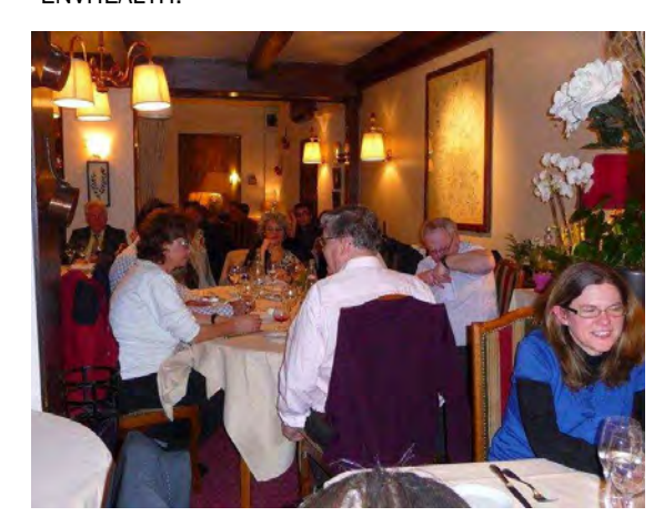
Dinner in Maisons-Alfort on 29/03/2011

to start thinking about the future and start developing ideas and strategies for continued trans-national cooperation and collaboration. The review meeting and the work sessions planned on the 30th of March provide the ideal forum to take stock of the progress and in particular the ambitions for ERA-ENVHEALTH.