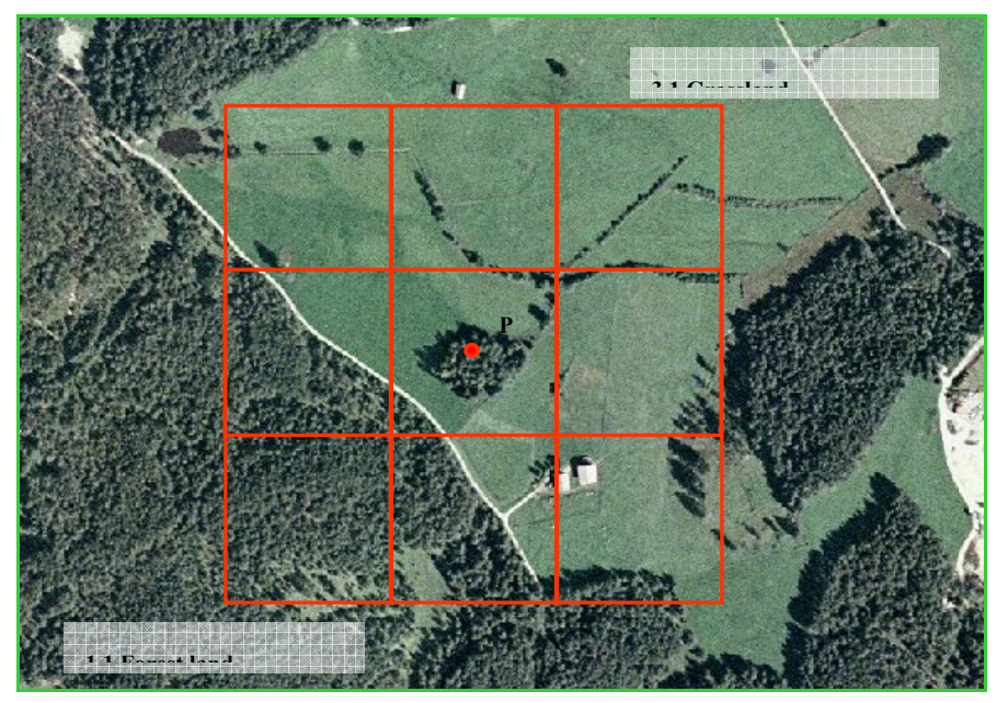
Figure A1.1: Land use classification system - grassland