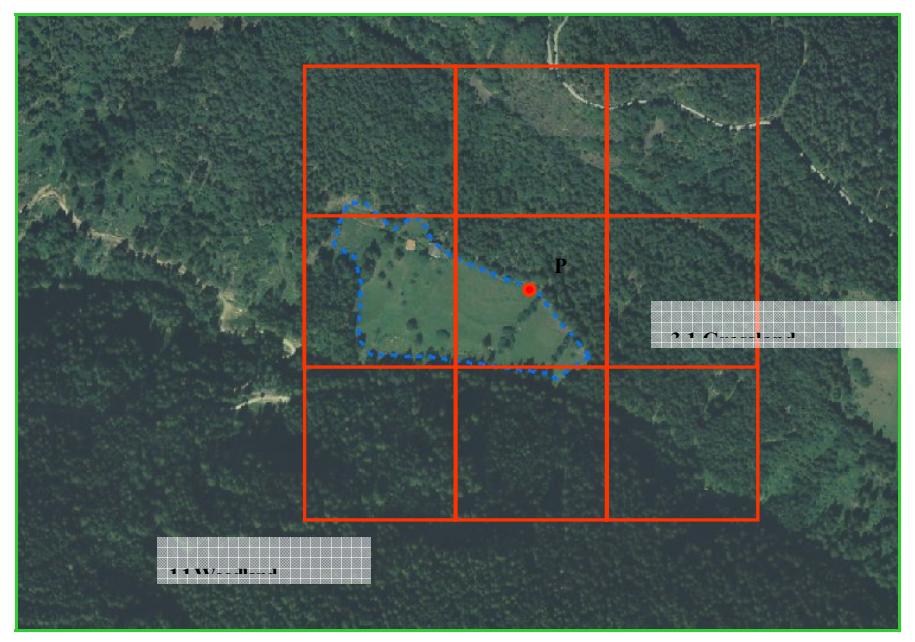
Figure A1.2: Land use classification system - Woodland