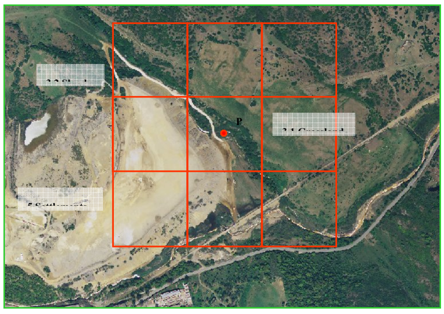
Figure A1.3: Land use classification system – grassland