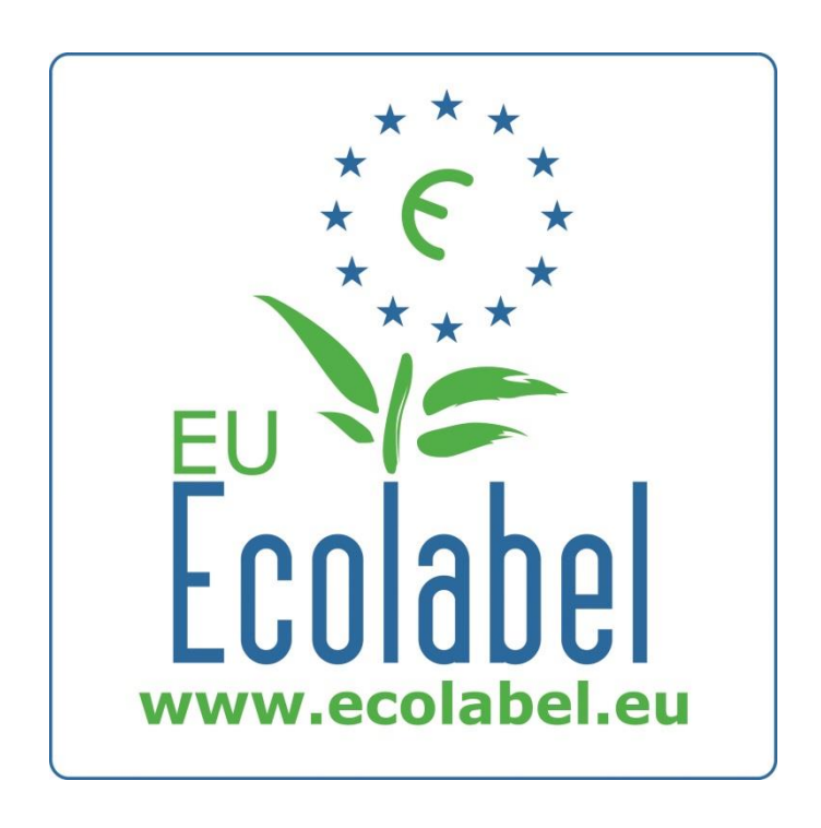
Final Draft - Version 1.0 of 11/05/2017