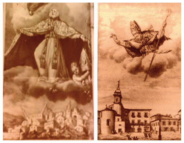
Fig. 5 - Earthquake saints and earthquakes in Chieti. Top: San Giustio appears on the shaking city during the 1706 earthquakes of the Majella, and Sant'Emidio appears on Trinità Church during the 1881 earthquake.

Concerning material seismic monuments, the term "temple" (templum) that we use today did not refer specifically to buildings or places of a cult and consequently is a poor indicator of the sacred bond with a deity. Aedes is a term that more properly defines the "home" of the deity. Fanum is indeed the natural sacred place where a sacrifice or devotion is made. Aedes and Fanum were wellsettled by the Roman sacred law and their evidences in Abruzzi are both historical and archaeological. The Majella-Sulmona area has many pre-Roman shrines which extend towards Aesernia (Isernia). Along this path are distributed occurrences of very ancient fertility cults and Aedes and Fanum, which are linked to telluric phenomena. From north to south, shrines show evidence of sudden collapse and rebuilding and many have been converted into Christian churches.