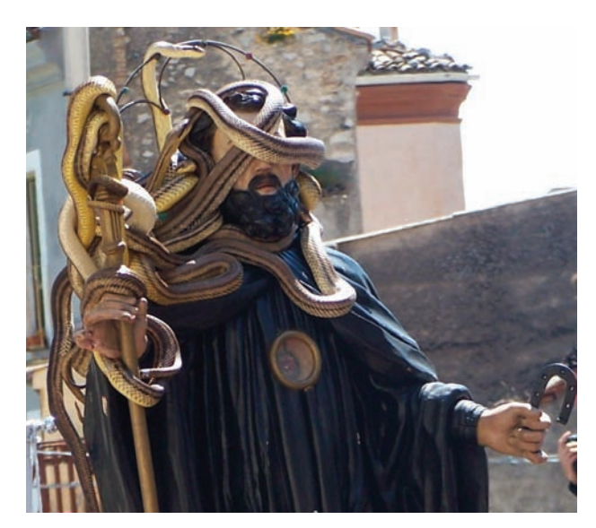
Fig. 7 - San Dominic statue covered by snakes. - San Domenico statua coperta dai serpenti.

Another interesting link between underground rivers, snakes, and sulphur springs is the local belief that the water of the Sulphur rivers (called Petogna) can protect against poisonous snake bites. It is no surprise that the Petogna rivers are in the most seismic areas in Abruzzi such as Conca del Fucino and L'Aquila.