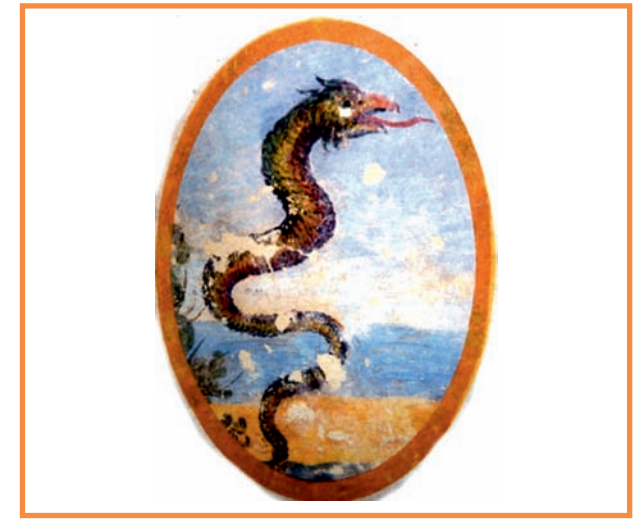
Fig. 2 - The dragon in the Caldora's arms at Castrovalva, near Cocullo. - Il drago in braccio alla Caldora presso Castronalva, nei pressi di Cocullo.