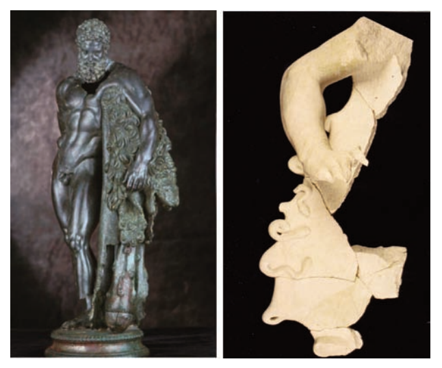
Fig. 6 - Statue of Hercules from the shrine of Sulmona and serpentine mantle of the divinity of Castel di Ieri. - Statua di Ercole del santuario di Sulmona e mantello con serpenti della divinità di Castel di Ieri.