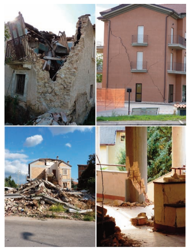
Fig. 1 - 6 April 2009 earthquake damage in private and public buildings of different kinds in L'Aquila, Abruzzi, reflecting the social vulnerability due to poor acceptance of living in a very seismic area.

The influence of earthquakes on Abruzzi cultural heritage is impressive and deserves a better insight with the aim of understanding why a symbolic representation of the earthquake is constructed instead of a rational approach being chosen. This mechanism extends to the present and involves mass media and political authorities. In addition, there is a possibility that seismic events, which are not easily measurable, quantifiable, or reproducible, determine reminiscences that could lead