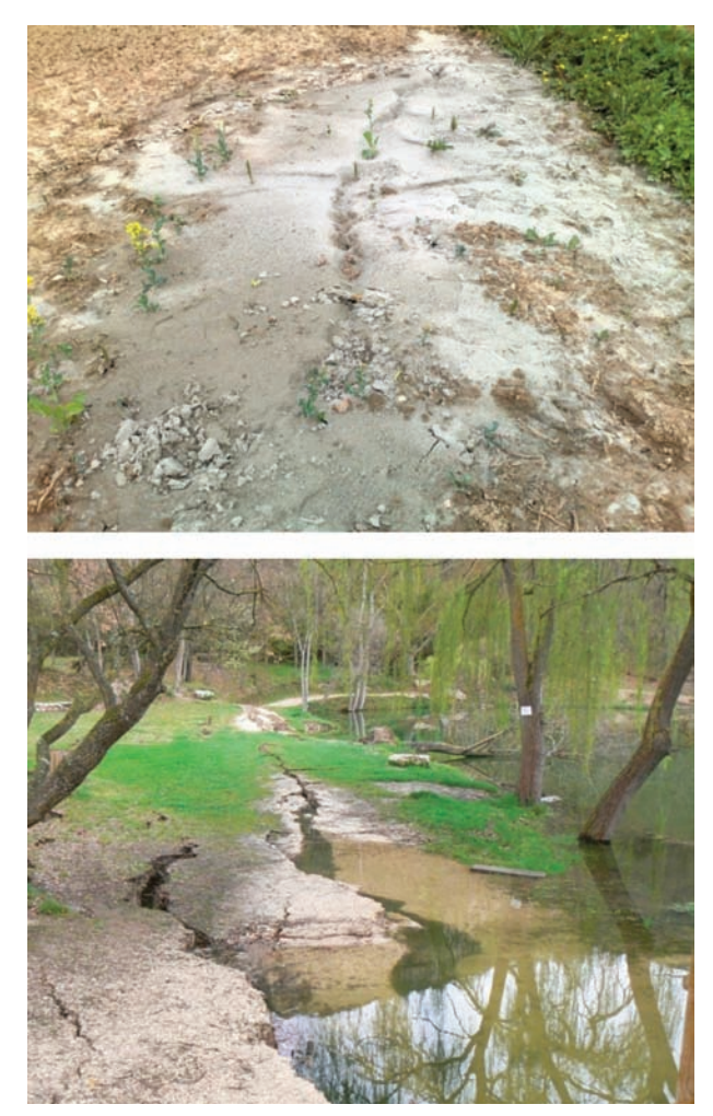
Fig. 3 - A - Sand volcano, Vittorito. B - Senizzo sinkhole collapse at San Demetrio dei Vestini, earthquake of 6 April 2009. - A - Sabbia vulcano, Vittorito. B - Senizzo sinkbole a San Demetrio dei Vestini, terremoto del 6 aprile 2009.

But what are the natural characteristics of the phenomena that triggered this type of worship and kept it alive in various forms for thousands of years? In any ancient or new form of thaumatosis any sign of exhalation from the earth is important. It is known that gas emission (CO<sub>2</sub>, radon) is generally related to active tectonics and is an earthquake precursor. The concept of thaumatosis is allied to theophany (i.e. the appearance of a deity), which occurs by the action of the spiritus, testified by seismic flashes, roars and sudden wind, gaseous emissions, gas torches, patches where the vegetation dies and does not grow, intermittent water springs, subsidence, fractures and dislocations, and sand and mud volcanoes (fig. 3). All these effects are typical of active seismic areas and where these effects are more evident, frequent, and intense, rites were established or Italic or Roman temples were located in Abruzzi (STOPPA, 2010a). Very frequently archaeologists and anthropologists miss the broader link to geological structures and events with which they are unfamiliar and prefer to relate cult location to the presence of a minor feature (e.g., a water spring, a peculiar